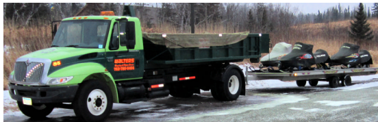
Casey Heller (Support Vehicle, Walters Recycling & Refuse)

Weather conditions didn’t stop the Northland 300 event from taking place. Snowmobilers trailed from Two Harbors to Tower where they